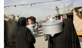
The Surge At Year One