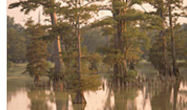
A Green Day for Bush