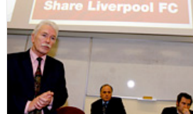
Can Fans Buy Their Team?